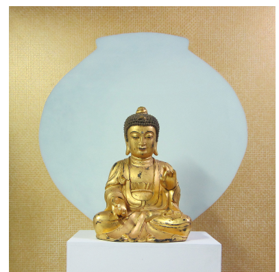
Ik-Joong Kang. Moon Jar with Golden Karma , 2015, Mixed media on wood, 72 x 72 in

He is currently working on Totally Thames project, which is the London's largest annual outdoor cultural festival through the month of September 2016. Also, his works are acquired by The British Museum, London and The Guggenheim Museum, Bilbao .