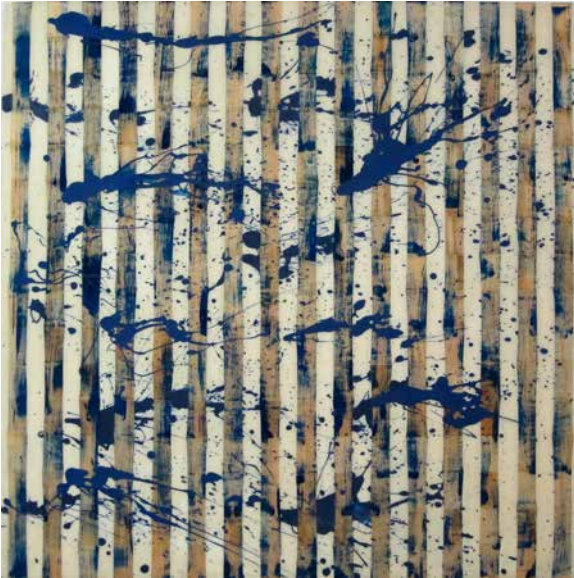
Ik Joong Kang Bamboo (Spring) 2013 Mixed Media on Wood each 48.5 x 48.5 in. (123.2 x 123.2 cm.)

Bamboo, also a Confucian symbol, is revered for its uprightness and strength. It was used as a symbol of perseverance and resilience.