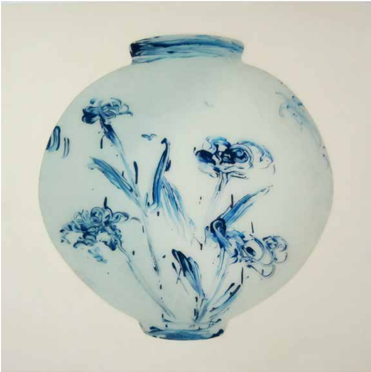
Ik Joong Kang Blue Chrysanthemum Moon Jar 2011, Mixed Media on Wood 47 x 47 in. (119.4 x 119.4 cm.)

Kang’s work explores Korea’s historic past juxtaposed with the contradictions and challenges facing modern day Korean society. Kang has taken elements from contemporary popular culture and fused them with classical Korean iconography to create a strikingly dynamic and amusing visual aesthetic using modern art making techniques.